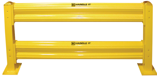
Double Rail System

When it is necessary to access equipment or space behind the guard rail system, lift-out adapters are available. These adapters use slot assemblies on the columns to allow the rails to be removed and then dropped back into place