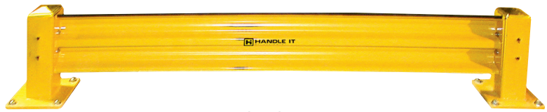
Single Rail System